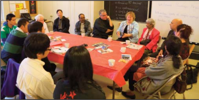
The Bishop's day at Advent began with him sitting in and visiting with the English Circle participants.