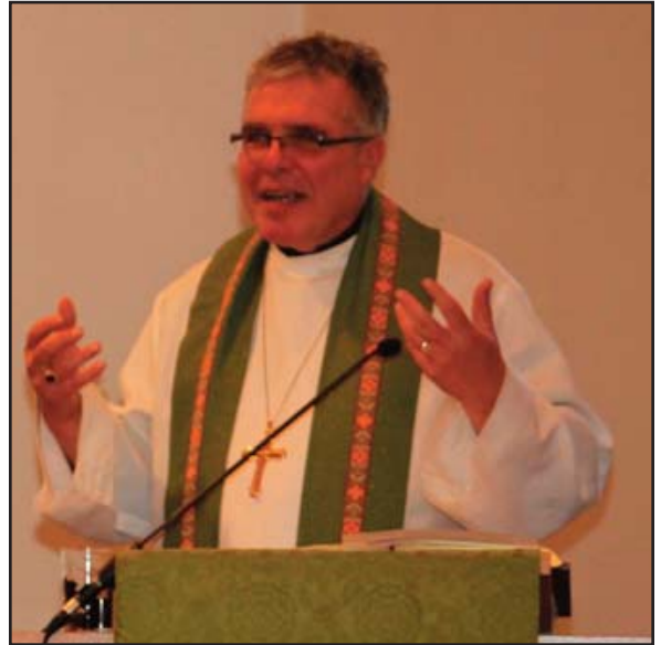
The Bishop preached the sermon.